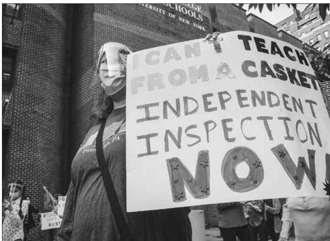
In the fall, PSC members at Hunter College Campus Schools mobilized against an unsafe reopening plan.

To get involved with the PSC Environmental Health and Safety Committee or ask health and safety questions, email hswatchdogs@psc-mail.org . Detailed health and safety guides are available at psc-cuny.org/about-us/environmental-health-and-safety and psc-cuny.org/covid-19 . The Watchdogs meet every other Thursday at 3:30 pm. For meeting dates, visit psc-cuny.org/calendar .