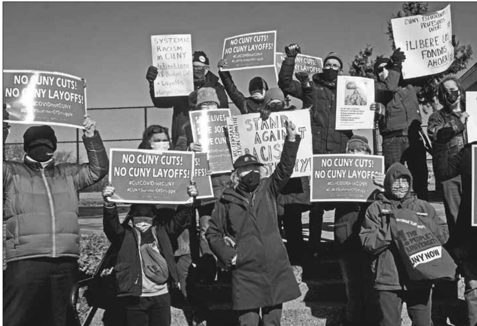
PSC members rallied against CUNY cuts in the Bronx in January.

History shows us that at times of crisis governments must not be timid in their response. The current crisis, like the Great Depression, demands visionary solutions, not defensive austerity. We urge you not to waste that support.