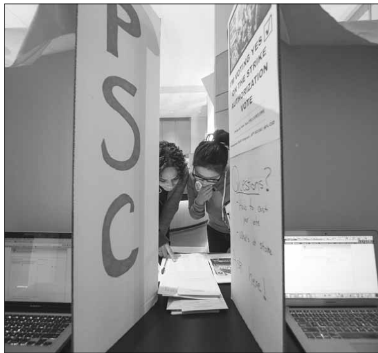
The PSC chapter at The Graduate Center constructed and staffed voting booths where union members could cast their ballots online.