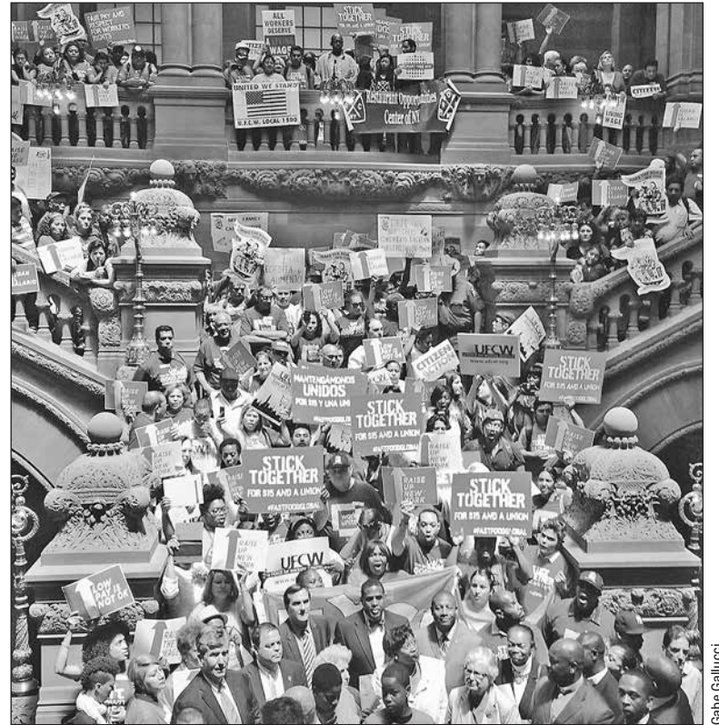
Hundreds of minimum-wage workers gathered inside the State Capitol on June 17, near the end of the legislative session. They called on lawmakers to raise New York's minimum wage from $8.00 to $10.10 an hour, indexing it to inflation and allowing cities to raise it even higher.