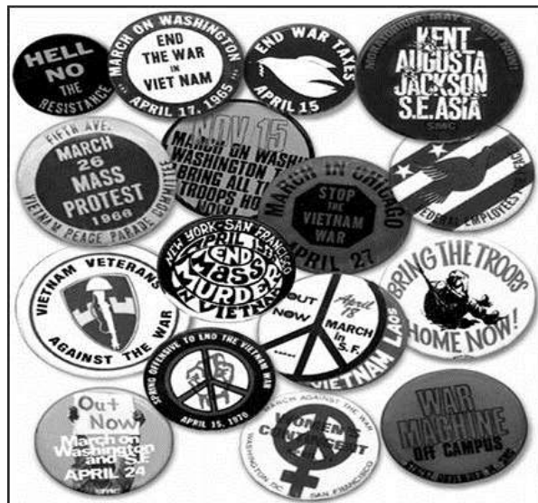
Vietnam era anti-war buttons

America and elite intellectuals" is not based upon facts.